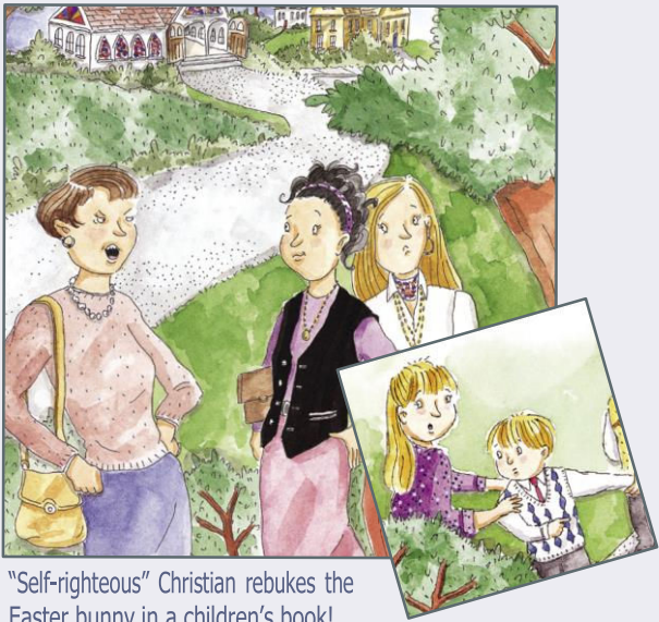
“Self-righteous” Christian rebukes the Easter bunny in a children’s book!

This profaning of God’s Word and holy things certainly sells the merchandise and draws the crowds, but God will destroy churches that hold Easter egg hunts. This violence against God knows no limits. A recent children’s book in the Christian market depicts a picture on its first pages of a grouchy, unloving Christian telling others that the Easter bunny is wrong. A church stands in the background, while puzzled Christian adults scowl and children leave in fear and dismay. The book continues expounding whitewash to combine the Easter Bunny with the resurrection of Jesus.